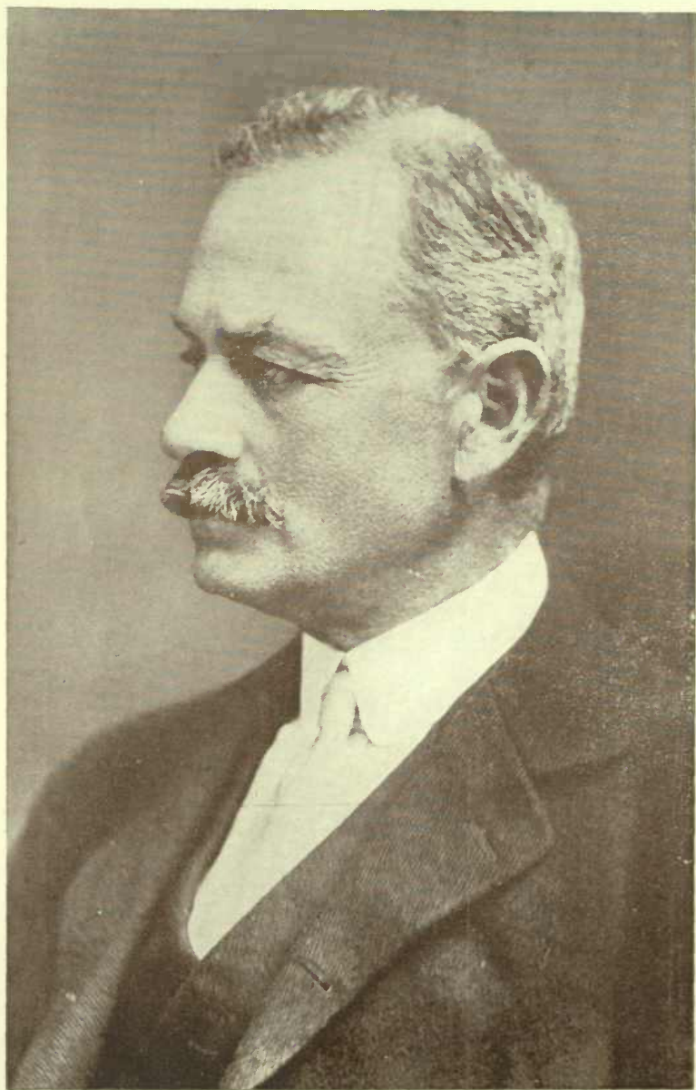
LORD BYNG OF VIMY Commander of the 3rd Army